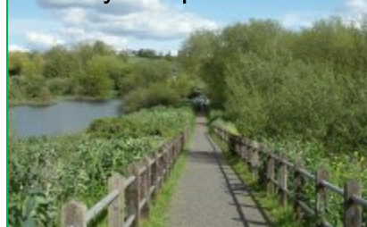
Lea Valley water park

My route followed the A25 from Westerham all the way to Dorking as I wasn't able