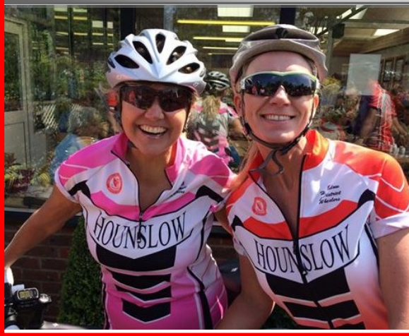
Below: Café stop

For more information about Hounslow & District Wheelers, visit our web site: http://www.hounslowanddistrictwheelers.co.uk/ To discuss articles in this issue of the club magazine, you can use the forum: http://www.apollonia.org.uk/hounslow/