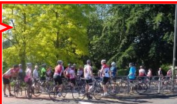
Above: Gathering at the Staines Bridge meeting point