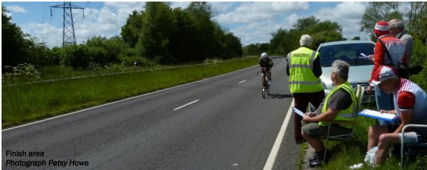
Finish area

I would like to take this opportunity to thank everyone who supported the event, whether as a competitor, timekeeper, helper or (as some may think, the most important) the tea ladies.