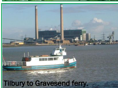
Tilbury to Gravesend ferry.